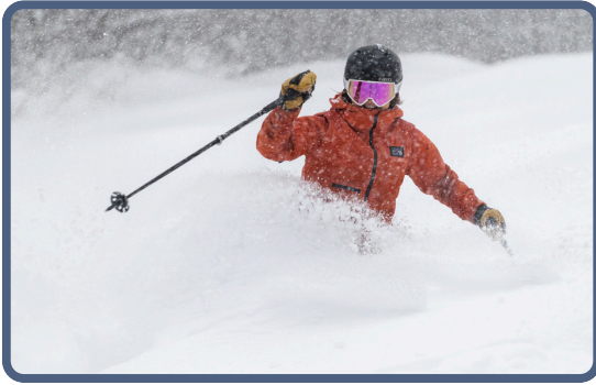
A skier hits the slopes at Sunday River in Newry, ME.