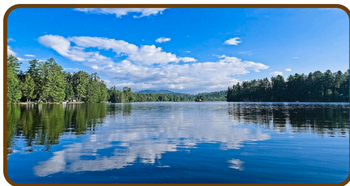
Pennesseewassee Lake, Norway, ME