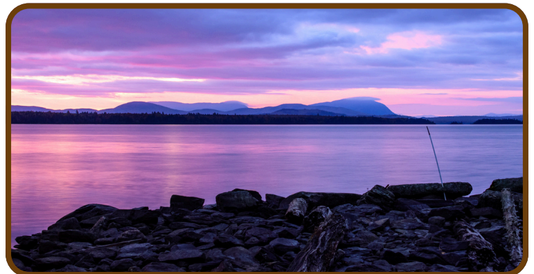
PHOTO: A sunrise over Moosehead Lake, Piscataquis County, Maine.

These locations from Greenville (CA Dean Hospital) to Dover-Foxcroft (Mayo Hospital) are gateways to the beauty of rural Maine. Greenville sits on the shores of Moosehead Lake, one of the largest lakes in New England and supports a robust tourism industry. Dover-Foxcroft boasts Sebec Lake, Peaks-Kenny State Park, and is only a 1-2 hour drive to Mount Katahdin. MERGE rural elective rotations offer the opportunity to learn from experienced physicians in a rural setting, while also enjoying all of the natural beauty that Maine has to offer.