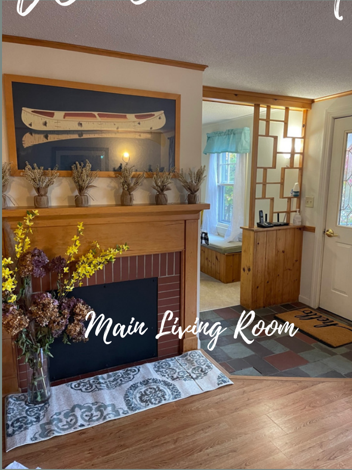
Main Living Room