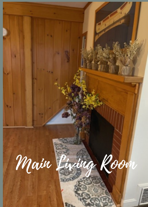
Main Living Room