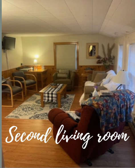
Second living room