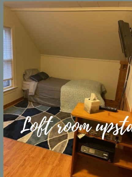
Loft room upstairs