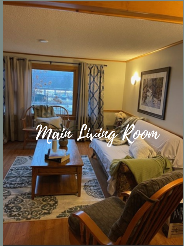
Main Living Room