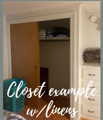
Closet example w/linens