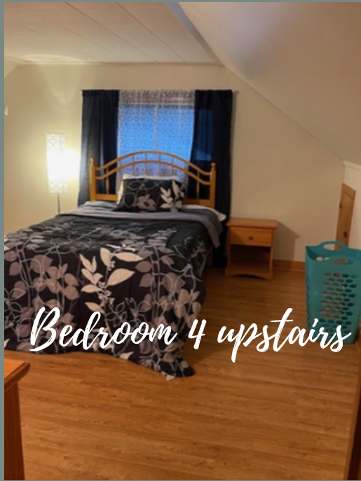
Bedroom 4 upstairs