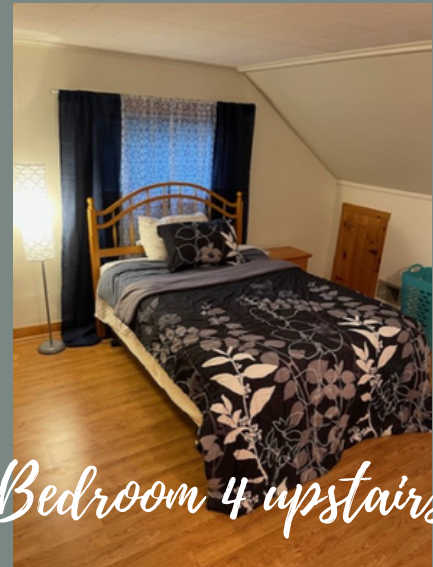
Bedroom 4 upstairs