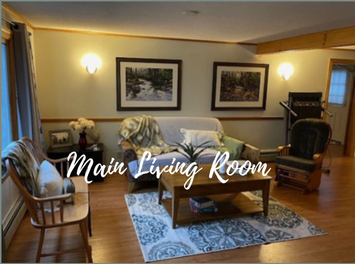
Main Living Room