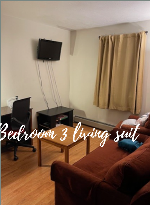
Bedroom 3 living suit