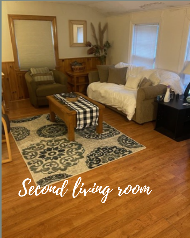
Second living room