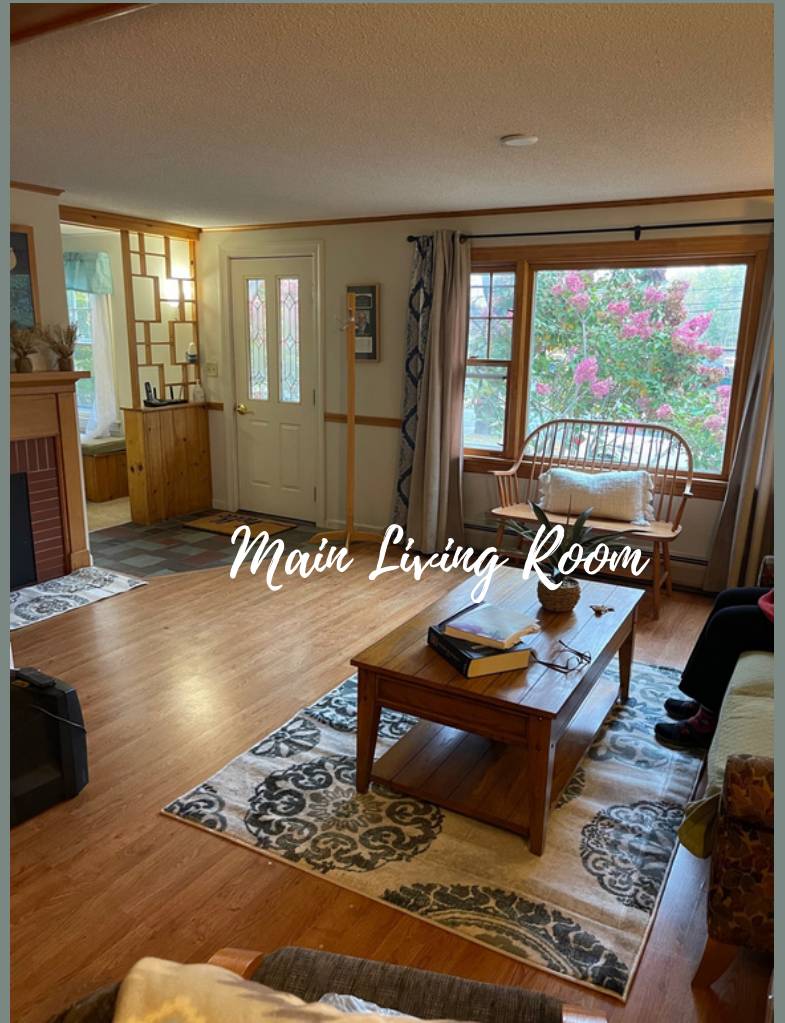
Main Living Room