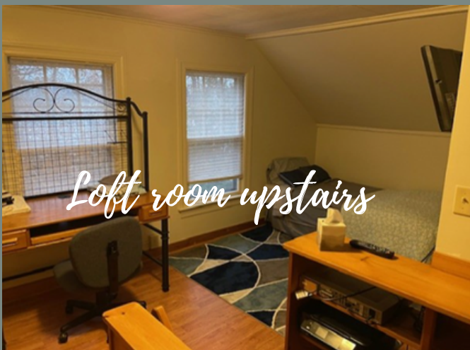
Loft room upstairs