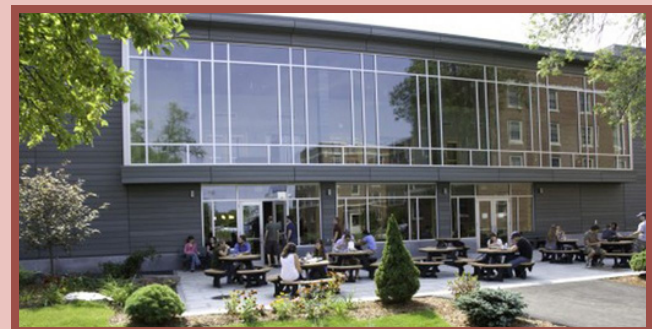
University of Maine, Wells Conference Center

The 2023 MERGE Conference had been planned for late October. Sadly, due to the tragedy in Lewiston, the conference had to be postponed. The conference is now scheduled for March 28th, 2024. Everyone scheduled for the conference in October has been registered for the new date in March. If anyone is interested in registering for the new date, the registration is open and can be accessed through the MERGE website at: