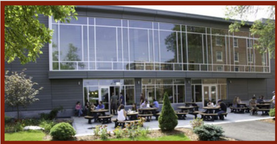
University of Maine, Wells Conference Center

October 27th is just around the corner and we hope that you can join us for the first annual MERGE Conference. This day of speakers and expert panels will address important issues in rural graduate medical education. Highlights include a presentation on diversity, equity, and inclusion within our rural spaces and a panel discussing the challenges of workforce